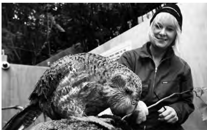
pictured above: the amazing Kakapo

Factors that caused their vulnerability to feral animals are as follows. A number of bird species became flightless as they had no native mammal predators and no need to fly to escape and evolved to fill gaps that normally mammals would take. The only land-based mammals in New Zealand are two bat species there are no carnivorous animals. A major defense of most of the New Zealand native birds against their native predators is to stay still. Raptors were their main predator and freezing still is the preferred defense. Historically, this instinctive behaviour served the birds well. Introducing feral animals into the environment, the native birds became inquisitive and often approach the noises to investigate. They have no instincts to relate noise generated from feral animals to danger. This made them very easy targets. Several of the native bird species also emit strong odours. This assists the native birds in locating each other in the dense forests. However, this makes it easy for feral animals to follow their scent. They also often roost and nest on the ground and low hollows where they are easily found by predators making especially nesting birds and their eggs.