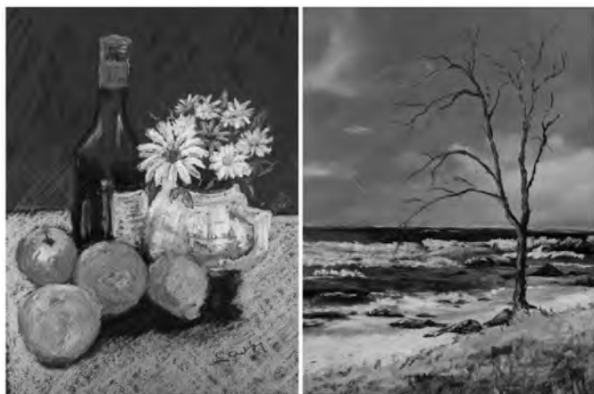
pictured above: photos of Gail Southwell's artworks