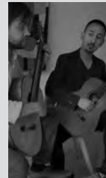
right: Duo Bosco classical guitar duo